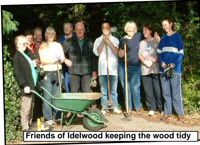
Friends of Idelwood keeping the wood tidy