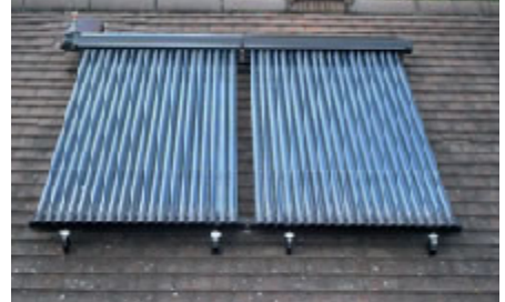
Pictures (generic pictures from 'Sunpowered Ltd, not Vida and Roy's house): Top, photovoltaic panels Bottom: solar thermal collectors.