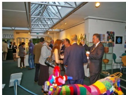
GREEN WEEK OPENING NIGHT